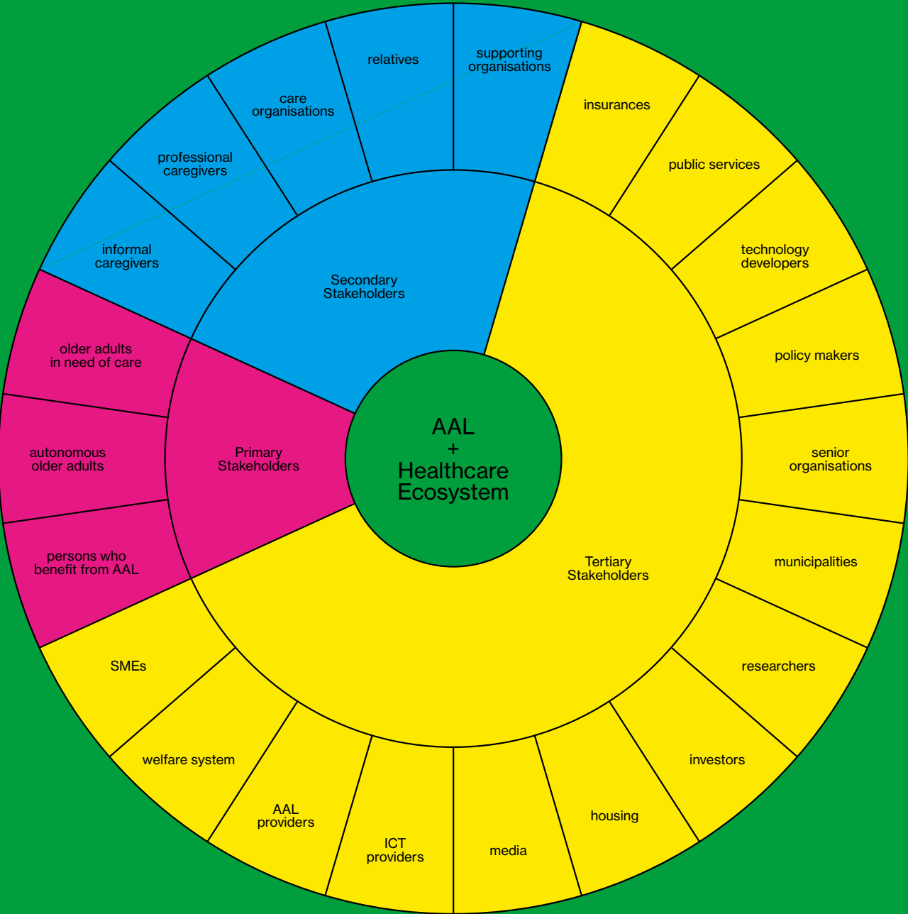
AAL Stakeholders Ecosystem